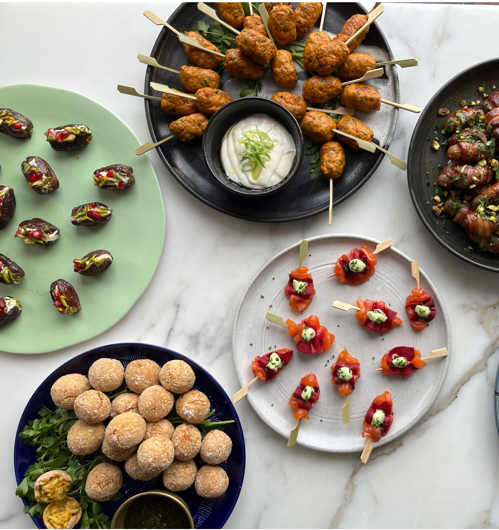
Sample Canapé Menu